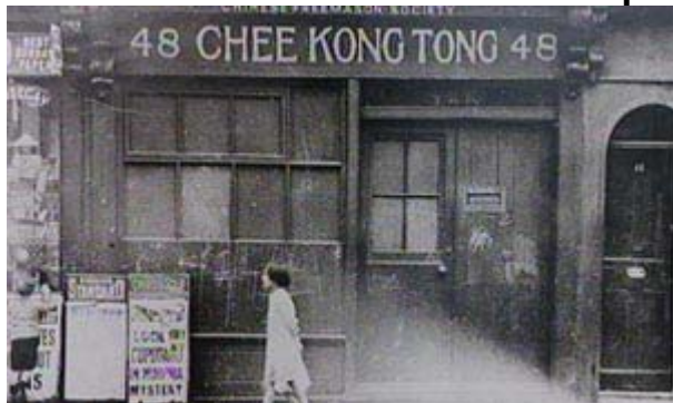
Gerrard Street, February 2005

Take a look at some fascinating pictures from London's Chinese Community..